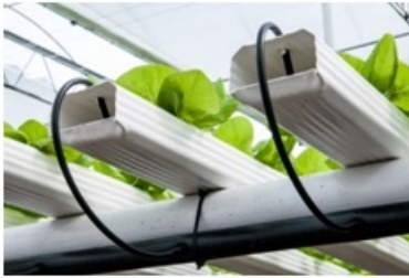
Photographs of our butter lettuce being grown.

Pursuant to a letter agreement dated December 2, 2013 with Heartland Growers Inc. ("Heartland"), Heartland agreed to cultivate the full line of Edible Garden produce to be sold throughout the Midwestern United States. Pursuant to the terms of the agreement, Edible Garden will manage the marketing and sales, while Heartland will be responsible for the cultivation, packaging and shipping of the product for retail sale under the Edible Garden brand. The term of the agreement is one year.