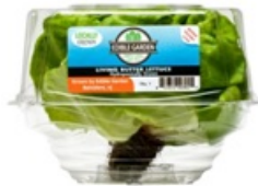
Photograph of Edible Garden's butter lettuce sold in retail stores.