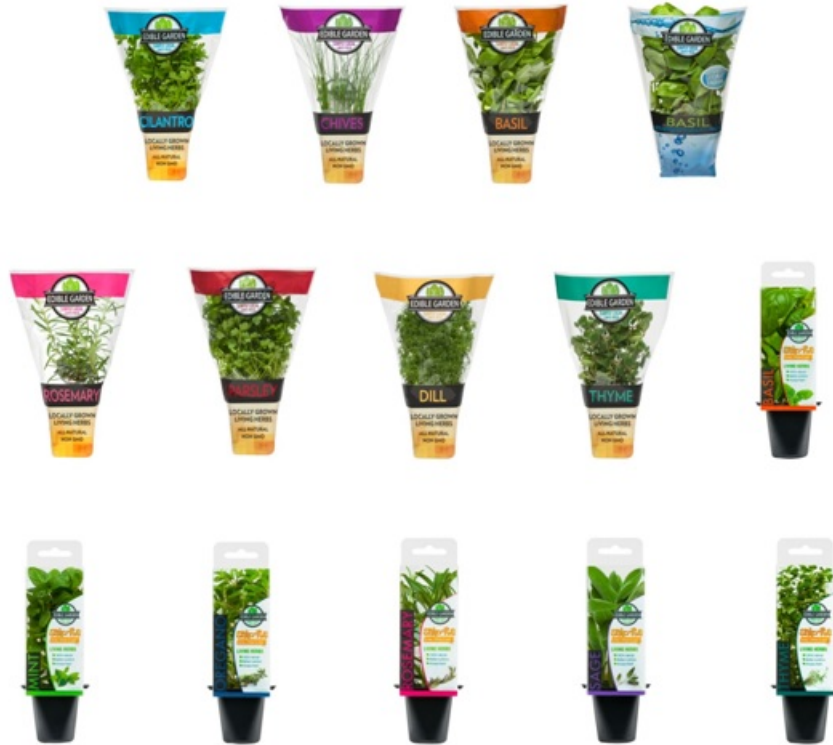
Photographs of Edible Garden's herbs that are sold in retail stores.