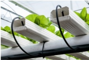
Photographs of our butter lettuce being grown.

Pursuant to a letter agreement dated December 2, 2013 with Heartland Growers Inc. ("Heartland"), Heartland agreed to cultivate the full line of Edible Garden produce to be sold throughout the Midwestern United States. Pursuant to the terms of the agreement, Edible Garden will manage the marketing and sales, while Heartland will be responsible for the cultivation, packaging and shipping of the product for retail sale under the Edible Garden brand. The term of the agreement is one year.