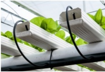
Photographs of our butter lettuce being grown.

Pursuant to a letter agreement dated December 2, 2013 with Heartland Growers Inc. (“Heartland”), Heartland agreed to cultivate the full line of Edible Garden produce to be sold throughout the Midwestern United States. Pursuant to the terms of the agreement, Edible Garden will manage the marketing and sales, while Heartland will be responsible for the cultivation, packaging and shipping of the product for retail sale under the Edible Garden brand. The term of the agreement is one year.