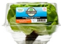
Photograph of Edible Garden's butter lettuce sold in retail stores.